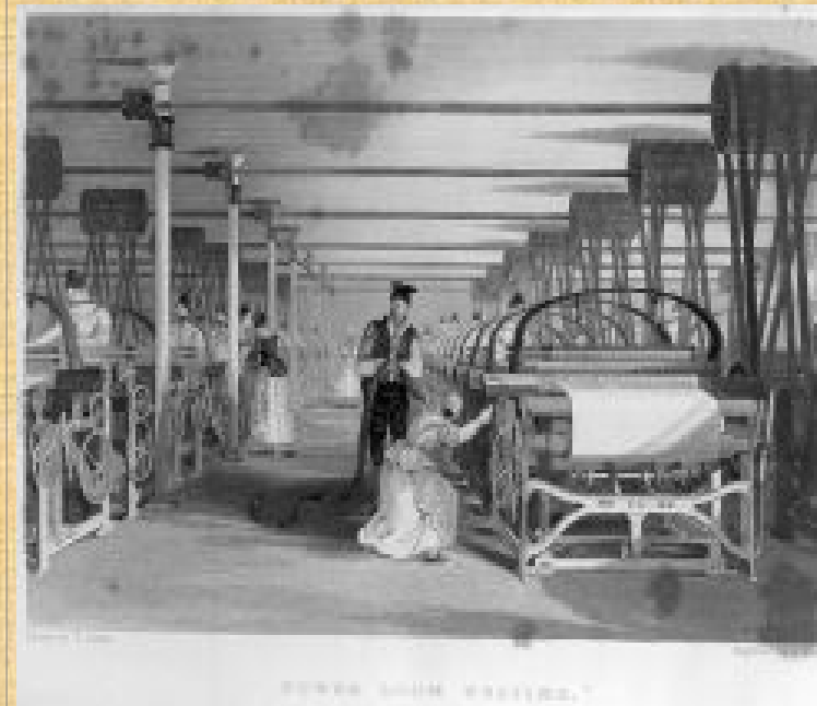
Power loom weaving in Britain