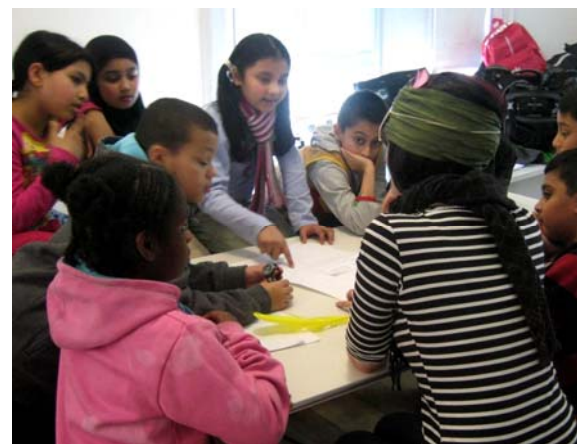
Students from John Scurr and Columbia schools meet at the Whitechapel Gallery and take part in an activity.

This is now a package of eight afternoon sessions that schools can buy, and which fulfils many aspects of the primary school curriculum.