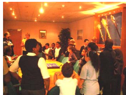
School councillors in the Mayor's Chamber learning about the Mayor

HEC's first event for Who Do We Think We Are? Week was for teachers and children to learn about the job of solicitors and children's rights.